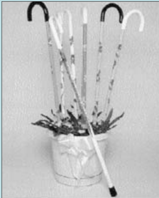
She Canery is an assortment of women's hand decorated canes in floral and other patterns and clear-coated to protect the pattern.