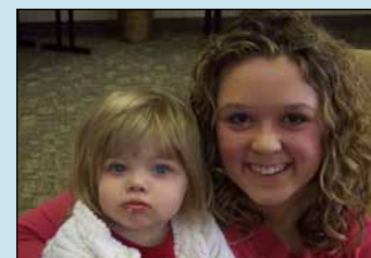
STAR: Changing the face of CMT Research See page 9