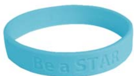
Be a STAR Wristbands