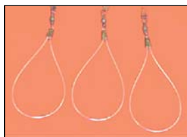
CLEAR ZIPPER PULLS

CMT, most of the afflicted members experienced a sudden, sense-of-humor renaissance. Relatively speaking, even during the worst of times, I’d never picked up a mental block when it came to toying with words. At a family congregation, soon after our funny-bone reformation had commenced, I was presented with a plaque (with some obvious apprehension that the accolade might spin me off into a whole new cycle of wordplay) declaring me the Prince of Pundland. I doubt that I’d be out on