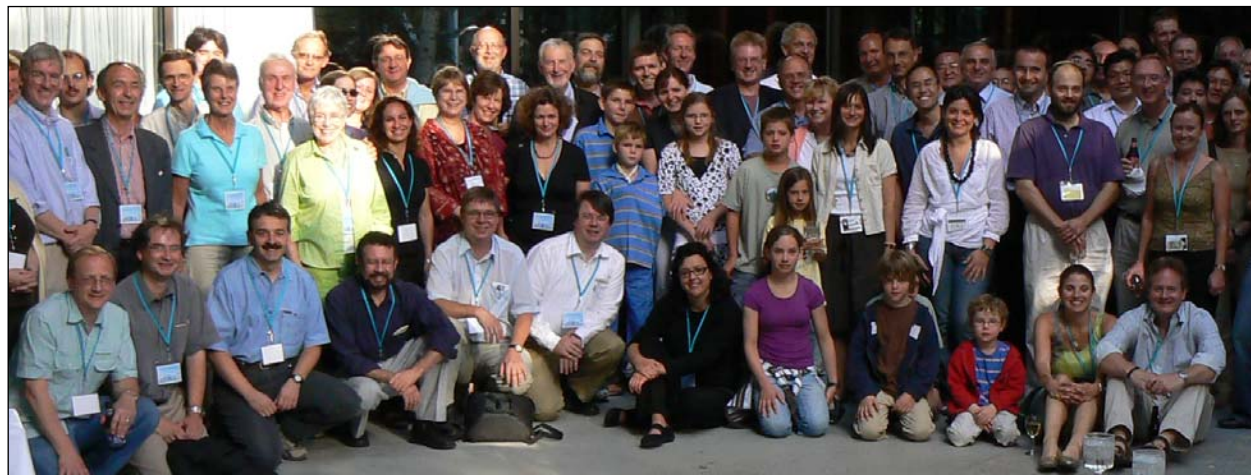
Many of the same faces in this 2007 photo from Snowbird, Utah, will be in Antwerp for the Third International Consortium.

In keeping with our evolving tradition of alternating the meeting site between North America and Europe, the Third International CMT