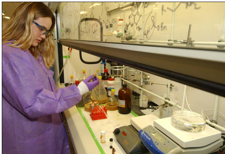
Work will soon begin at the NIH's ultra-high throughput screening and chemistry center.

In furtherance of this and future studies, the CMTA is establishing and funding a two-year postdoctoral fellowship (extendable to 3-5 years) at the NCGC. The NCGC is an ultrahigh throughput screening and chemistry center which discovers chemical probes of protein and cell functions, develops new paradigms to enable chemical genomics, and develops chemical starting points for new drugs for rare genetic and orphan diseases.