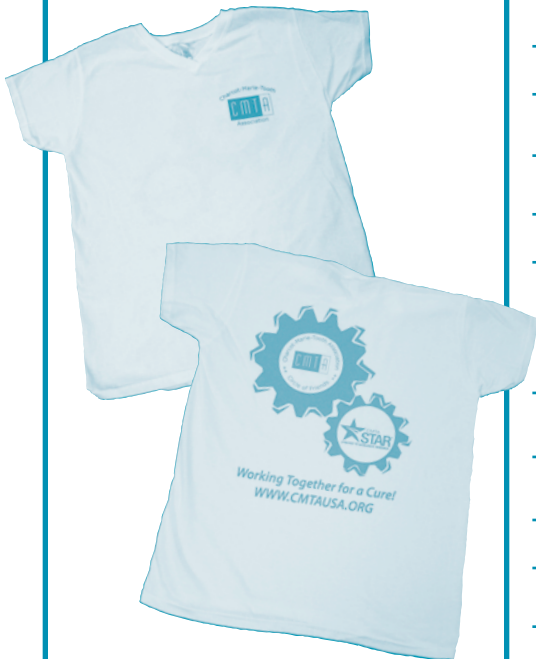
Circle of Friends T-Shirts