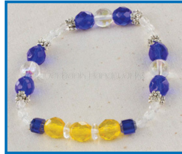
CMTstarstruck Happy Beaded Stretchy Bracelet: $15