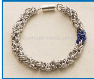
CMTstarstruck TriByz Bracelet: $30

The TriByz (priced at $30) is a storytelling piece. You can see it in the first picture to the right. This design tells our CMT story. When Emily was diagnosed with CMT2, we were surprised to learn that one random gene protein alteration could make her vulnerable to such a wide variety of symp-