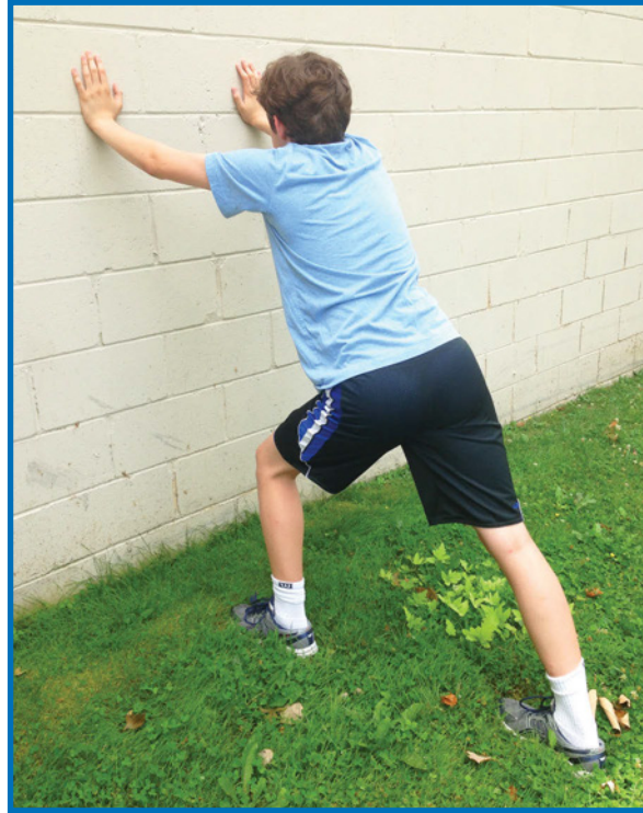
The calf stretch helps improve or maintain flexibility and range of motion for CMT patients.

In individuals with CMT, muscle imbalances also contribute to deformities in the feet and hands. In addition to the ankle, hands and feet, muscle imbalances and subsequent loss of range of motion are also commonly seen in the knee, hip, and wrist in individuals with CMT