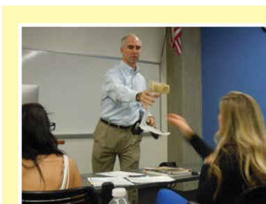
Branches benefit from visiting professionals... See page 14