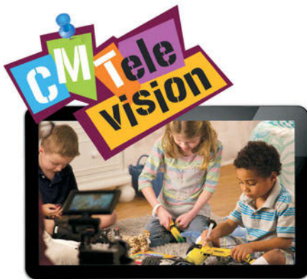
We're Network SuperSTARS