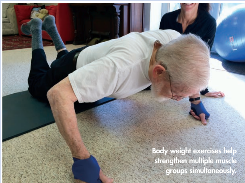
Body weight exercises help strengthen multiple muscle groups simultaneously.