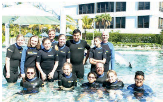
CMTeens at the Miami Seaquarium

After seeing several exhibits and a whale show, it was time to meet the dolphins. We changed into wetsuits for the swim. Taking off our braces and getting into the cold pool water was hard for almost all of us. That is the amazing part: I was not alone for once in my life. It was okay to struggle because everyone else was struggling too, so we just helped each other and had fun doing it. After we changed, we got in the water with the dolphins. Swimming