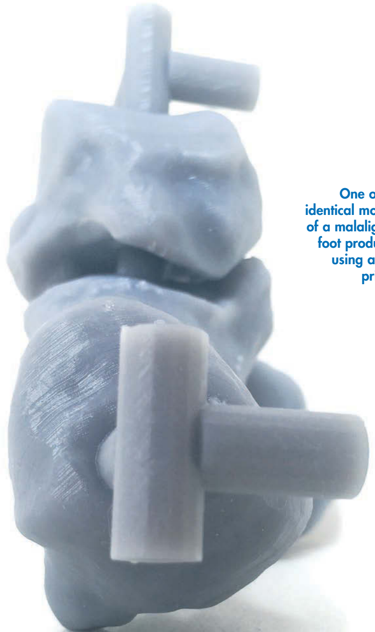
One of 18 identical models of a malaligned foot produced using a 3-D printer