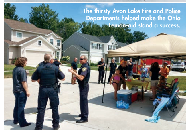
The thirsty Avon Lake Fire and Police Departments helped make the Ohio Lemon-aid stand a success.