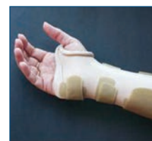
CUSTOM MADE SPLINTS