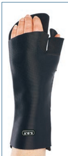
A RESTING HAND SPLINT: Allard "S.O.T." resting WHO

A resting hand splint , which can be used daily or solely at night, provides a prolonged stretch that promotes safe joint positioning and reduces morning stiffness. Resting hand splints are recommended for patients who need help with preventing contractures and with maintaining and increasing the range of motion in the fingers. The resting splint is also helpful in elongating and extending the wrist and fingers and preventing over-lengthening of