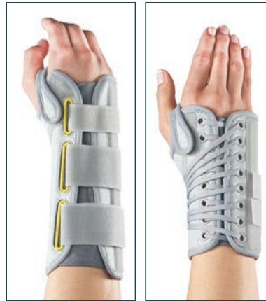
RESTRICTIVE MOVEMENT SPLINTS: Allard's Vission Laced and Strapped WHOs (above) and Allard's S.O.T. Thumb Splint (below)

weak or paralyzed muscles. The resting position can help with improving circulation and can support both the hand and finger joints, reducing the risk of hyperextension of the thumb.